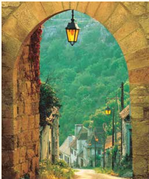
Cover: Visit the Dordogne River Valley, a rural idyll replete with hilltop castles and quaint villages.