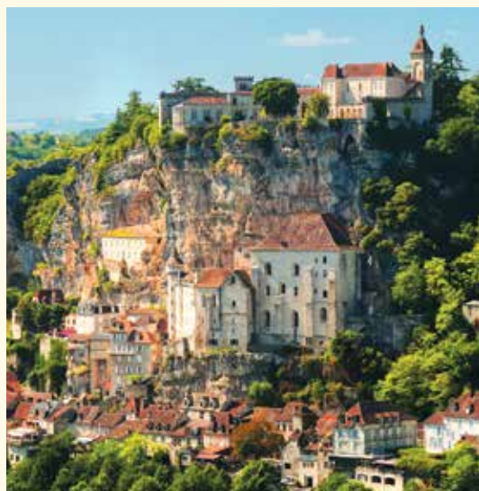
Rocamadour has beckoned travelers and pilgrims alike to its summit above a tributary of the Dordogne River.

Carved beneath a cliff overlooking the serene Vézère River, the prehistoric troglodyte village and UNESCO World Heritage site of La Madeleine offers unique insight into the semi-nomadic Magdalenian culture, which prevailed in southern Europe from 15,000 to 9000 B.C.