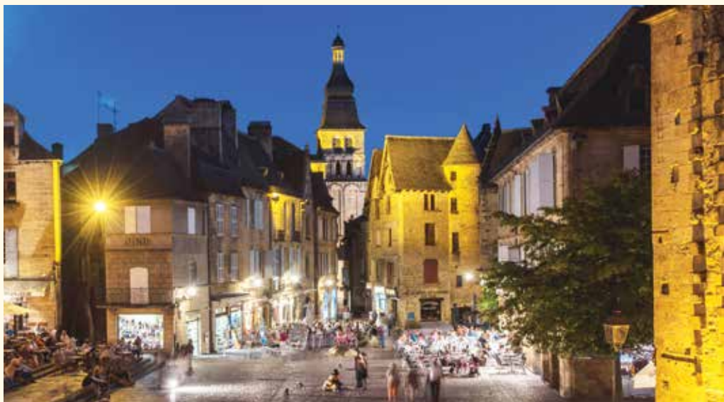
Relish regional specialties prepared from the freshest ingredients in the village of Sarlat’s delightful market, one of the best in France.

Built on the face of a sheer 400-foot cliff, the UNESCO World Heritage-designated village of Rocamadour has one of the most dramatic settings of any village in the world. During the Middle Ages, pilgrims flocked here from across Europe to perform penance