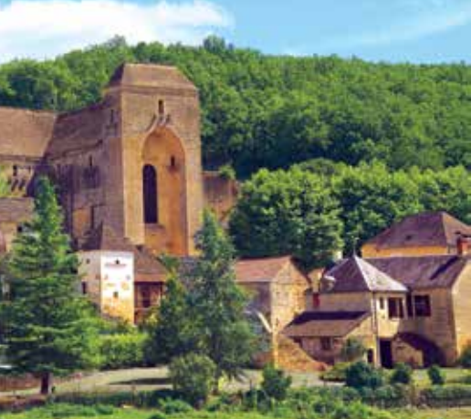
St. Amadour's yellow limestone Augustinian abbey,

by ascending the 216 steps of le Grand Escalier (the Grand Stairway) on their knees to pay homage to the Virgin Mary and to seek miracles from St. Amadour by visiting his crypt. Embedded in the cliff above the doorway to the Chapelle de Notre Dame is a sword said to be that of the heroic knight Roland.