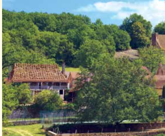
Lauze-roofed, medieval maisons cluster around Saint-Amand-de-Coly, one of the most striking of Périgord's fortified churches.