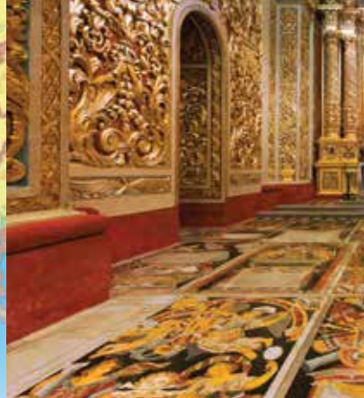
Baroque St. John's Co-Cathedral is a masterpiece with crests of the Knights of St. John above the altar.