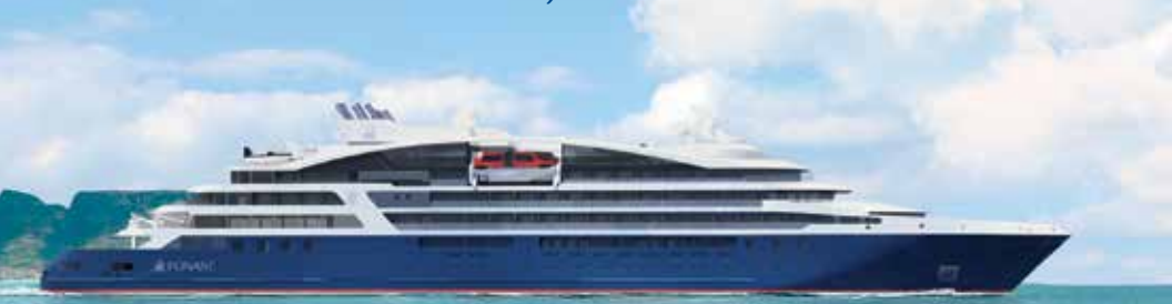
Artist rendering. LE LAPÉROUSE launching July 2018.