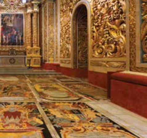
terpiece of artistry; the marble floors are inlaid with their respective tombs.

Admire the 14 th -century Gothic-Catalan-style Corvaia Palace, the medieval Baroque portal of the Cathedral of St. Nicola, and the Roman Odeon, the “small theater” built in 21 B.C. Stroll along Taormina’s famous Corso Umberto, a distinctively Mediterranean pedestrian thoroughfare.