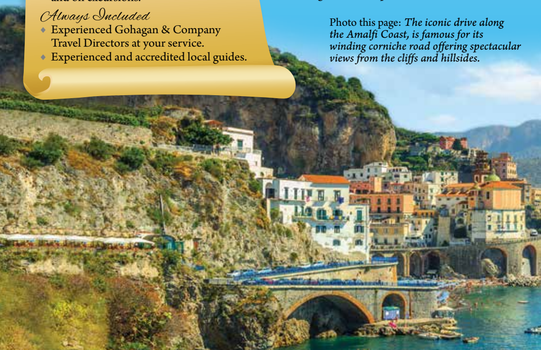
Photo this page: The iconic drive along the Amalfi Coast, is famous for its winding corniche road offering spectacular views from the cliffs and hillsides.

Cover photo: The well-preserved ruins of Taormina's classical Greco-Roman theater exemplify the ancient Greek philosophy that a city's most important buildings should complement nature.