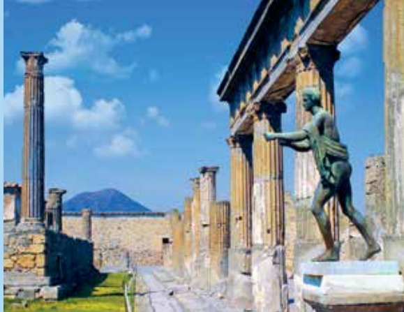
Found in fragments in 1817, this statue of Apollo was one of the first bronzes to be excavated at Pompeii.

The classical Greek world is reanimated in Agrigento’s monumental Valle dei Templi (Valley of the Temples), a UNESCO World Heritage site. Here, the landscape features eight Doric shrines dating from the fifth century B.C., including the Temple of Hera, with its graceful northern colonnade; and the Temple of Concordia, said to be one of the most beautifully preserved Greek monuments still standing.