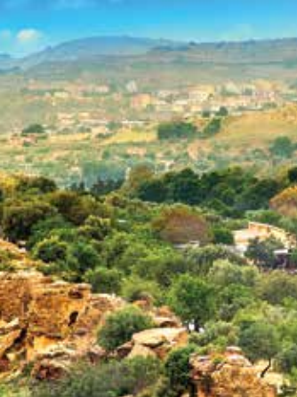
, built between 440 and 430 B.C., and the harmony of Classic Doric style.