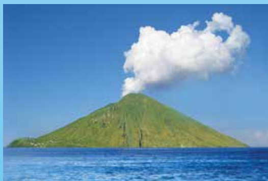
Admire the symmetrical cone and primordial beauty of Stromboli, a picture-perfect volcano.

Stroll along Taormina's distinctively Mediterranean pedestrian thoroughfare, Corso Umberto.