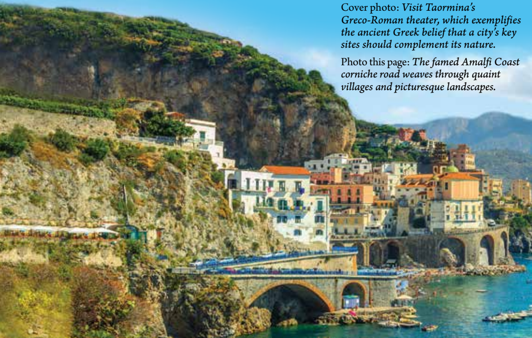
Photo this page: The famed Amalfi Coast corniche road weaves through quaint villages and picturesque landscapes.

Cover photo: Visit Taormina's Greco-Roman theater, which exemplifies the ancient Greek belief that a city's key sites should complement its nature.