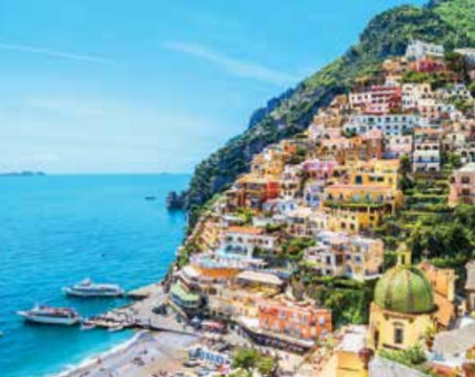
The beguiling coastal village of Positano forms part of the Amalfi Coast, a UNESCO World Heritage site.