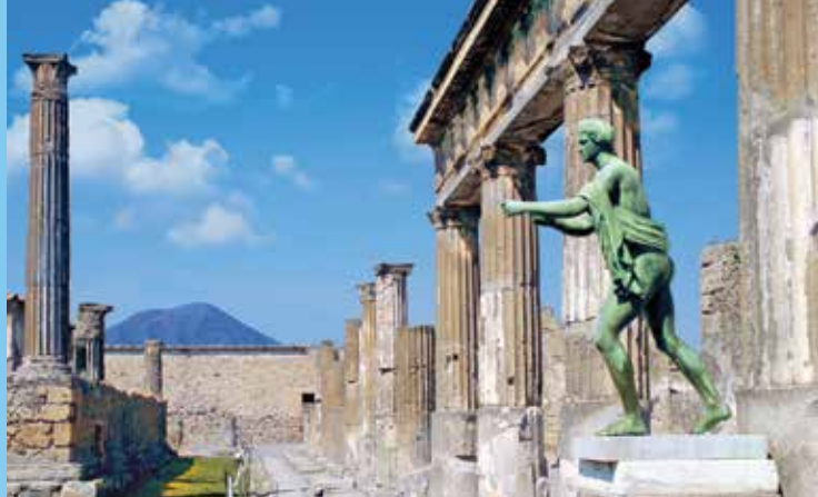
Discovered in fragments in 1817, this statue of Apollo was one of the first bronzes to be excavated at Pompeii.

spoke to ancient Siracusans, still in use today; the Roman Amphitheater, where gladiators competed for the crowds; the Altar of Hieron II; the limestone Ear of Dionysius cave; and the Archaeological Museum.